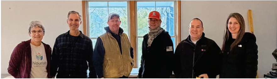
Standing in the future home of the Nantucket Food Pantry.

Nourish Nantucket's vision requires a strong network of partnerships, and our work wouldn't be possible without the following individuals and organizations: